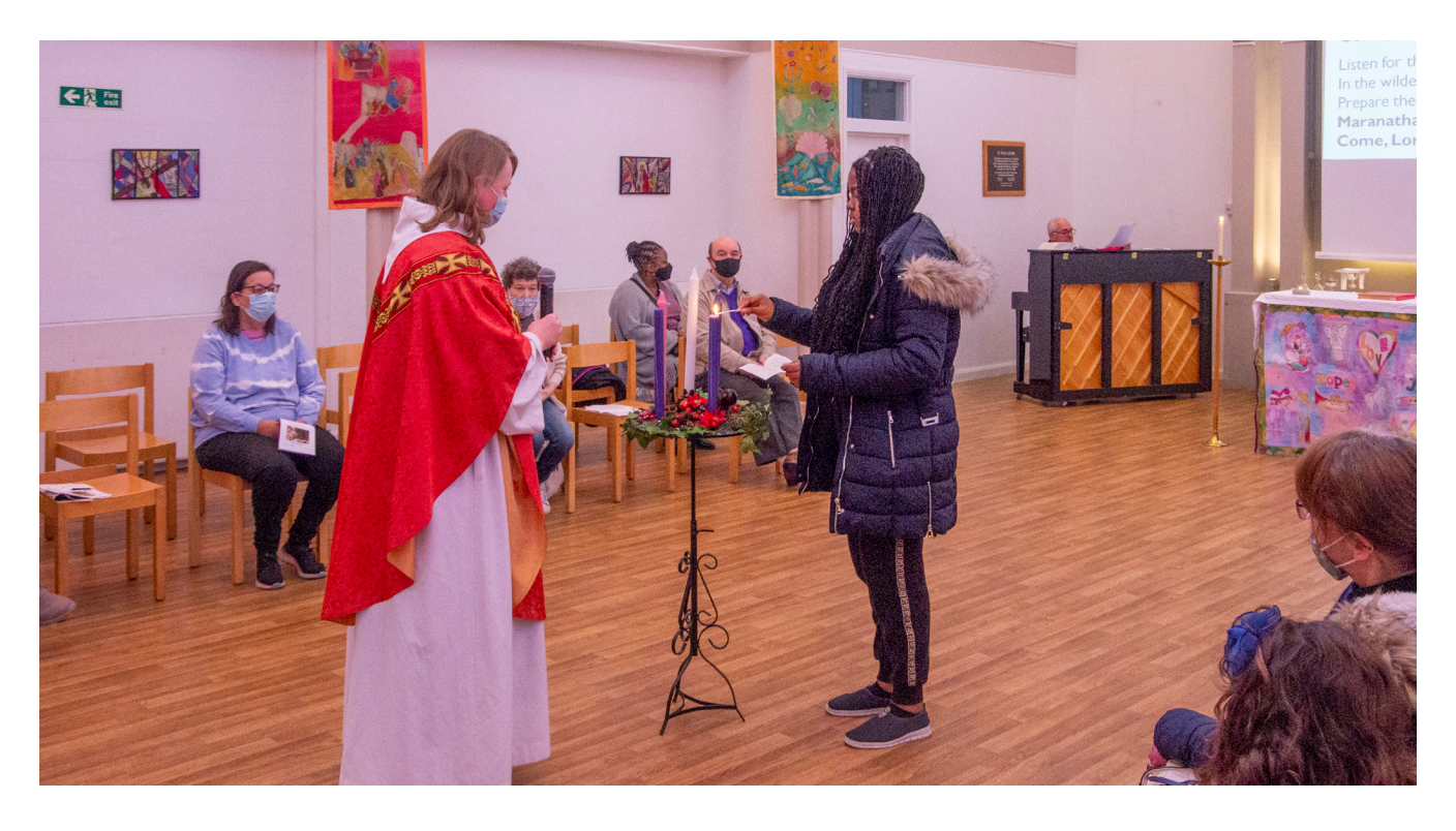
Lighting an advent candle - 12th Decemeber