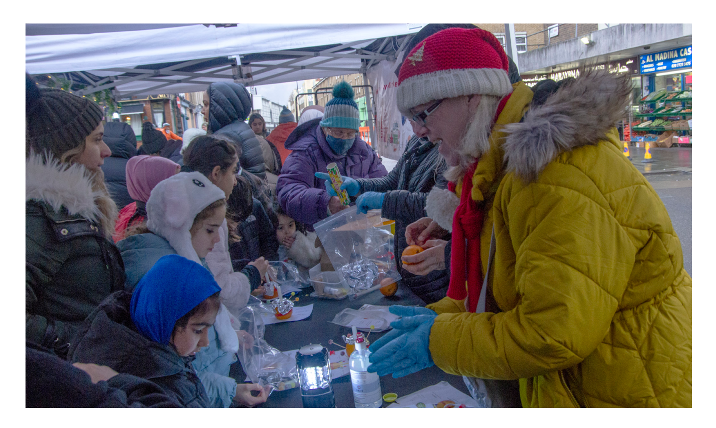
Christingle, Church Street - 5th December